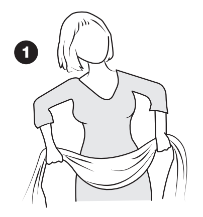
Take the cloth in the middle and hold it to your stomach