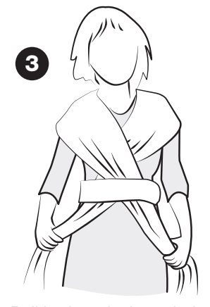
Pull both ends through the vertical pass and cross