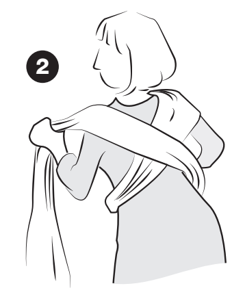
Pull the fabric to behind your back, cross it behind you and pull over the respective shoulders.